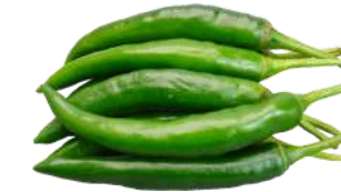
Green Chili 17.4 Kg USD 189.49