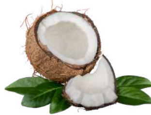
Coconut 850 Nos USD 337.37