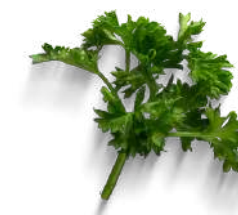
Parsley 16 Kg USD 422.71