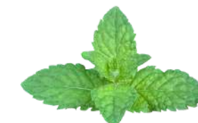
Mint 12 Kg USD 139.54