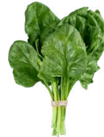
Spinach 12 Kg USD 63.48

During this year, we were able to harvest a total of 243.4 Kg of vegetables, and 2,570 numbers of coconuts worth USD 7,946.46.