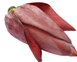
Banana Flower 8 Kg USD 13.31