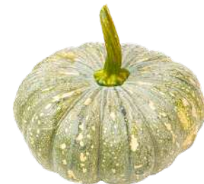
Pumpkin 87 Kg USD 36.76