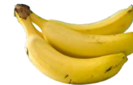
Banana 25 Kg USD 95.06