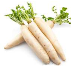
Radish 66 Kg USD 175.36