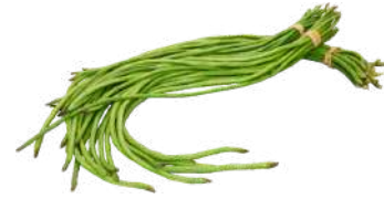
Long Beans 1 Kg USD 4.55

During this year, we were able to harvest a total of 832.55 Kg of organic vegetables & 28,294 Nos of Coconut worth USD 13,366.50.