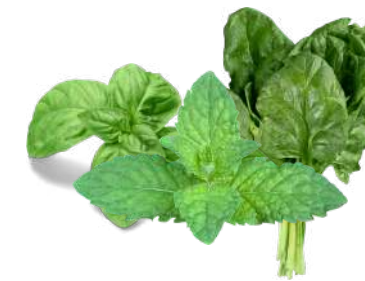
Green Leaves 528.6 Kg USD 1,825.92