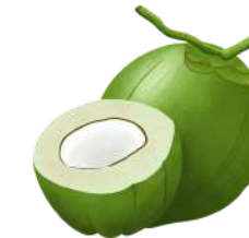
Kurumba 6,054 Nos USD 5,336.74