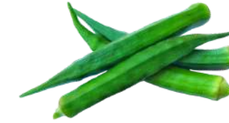
Ladies Fingers 56.3 Kg USD 106.56