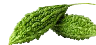
Bitter Gourd 24 Kg USD 52.80