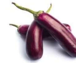
Brinjal 15.75 Kg USD 38.27