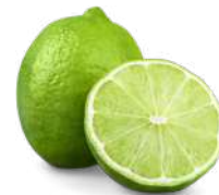
Lime 1 Kg USD 2.43