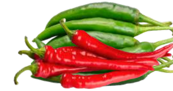
Green Chili & Hot Chili 50.5 Kg USD 192.56