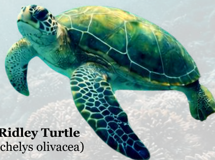
Olive Ridley Turtle ( Lepidochelys olivacea )