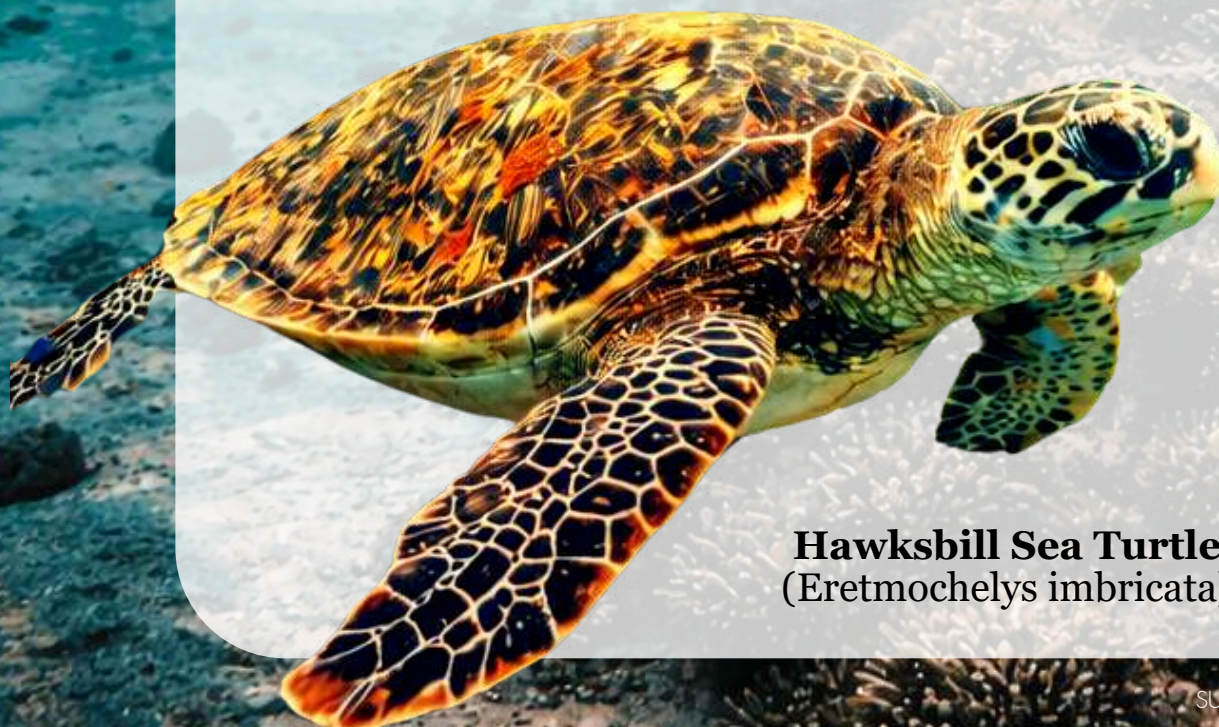
Hawksbill Sea Turtle ( Eretmochelys imbricata )