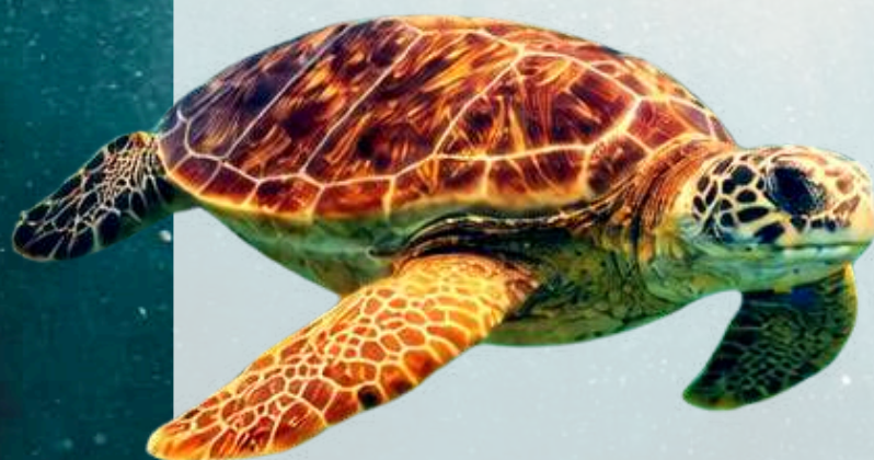
Loggerhead Sea Turtle ( Caretta caretta )