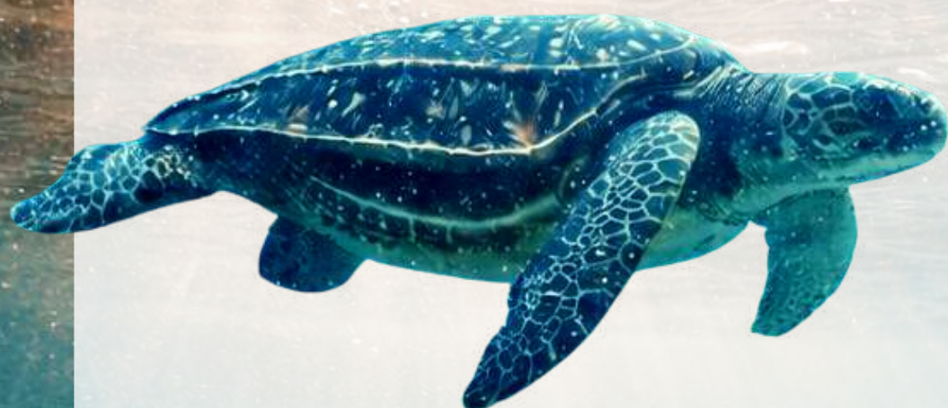
Leatherback Sea Turtle ( Dermochelys coriacea )

“These species highlight the Maldives’ rich marine biodiversity and the urgent need for continued conservation efforts.”