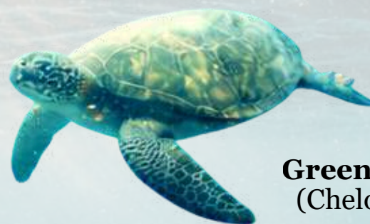
Green Sea Turtle ( Chelonia mydas )